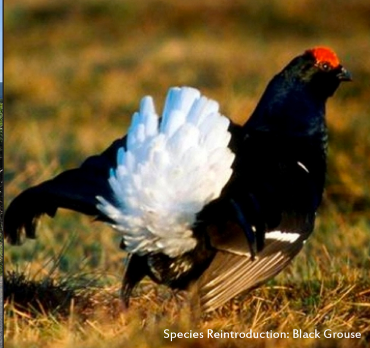
Species Reintroduction: Black Grouse

arrantrust tourism and conservation working in partnership