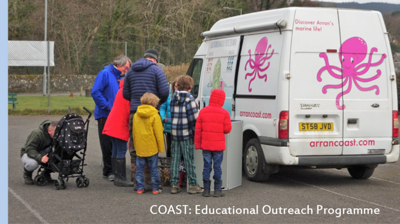
COAST: Educational Outreach Programme

All the Trustees have an interest in the environment, heritage and communities of Arran. They also understand the importance of tourism to the Island.