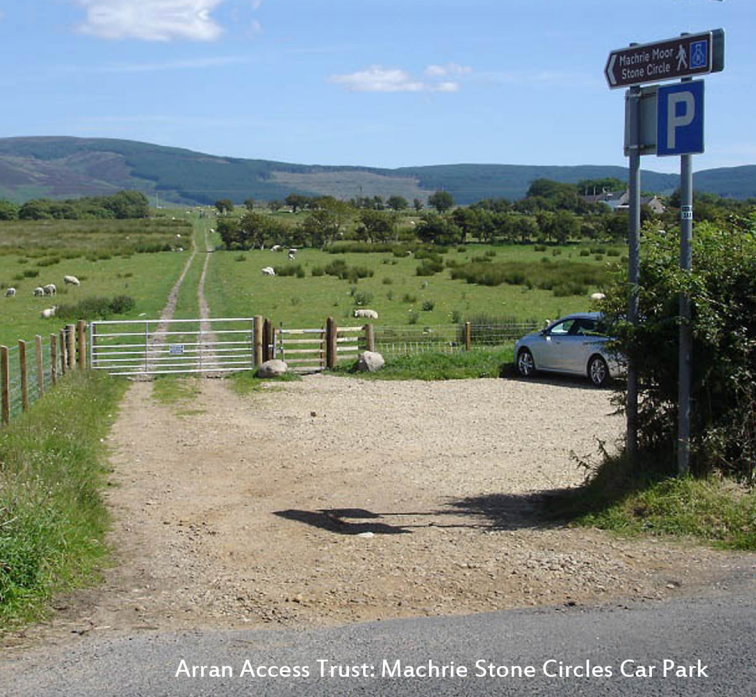
Arran Access Trust: Machrie Stone Circles Car Park