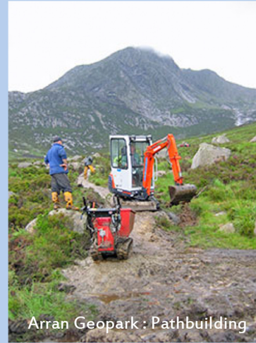
Arran Geopark : Pathbuilding

A large number of island businesses work with the Arran Trust, and visitors can donate through shops, accommodation providers, eateries, food producers and other businesses.