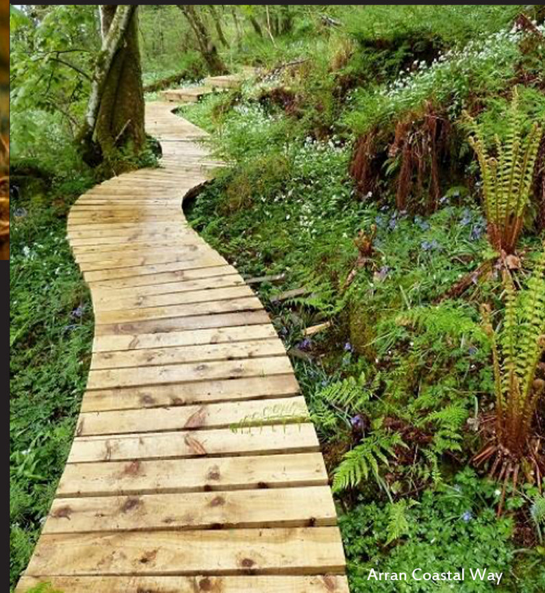
Arran Coastal Way

arrantrust tourism and conservation working in partnership